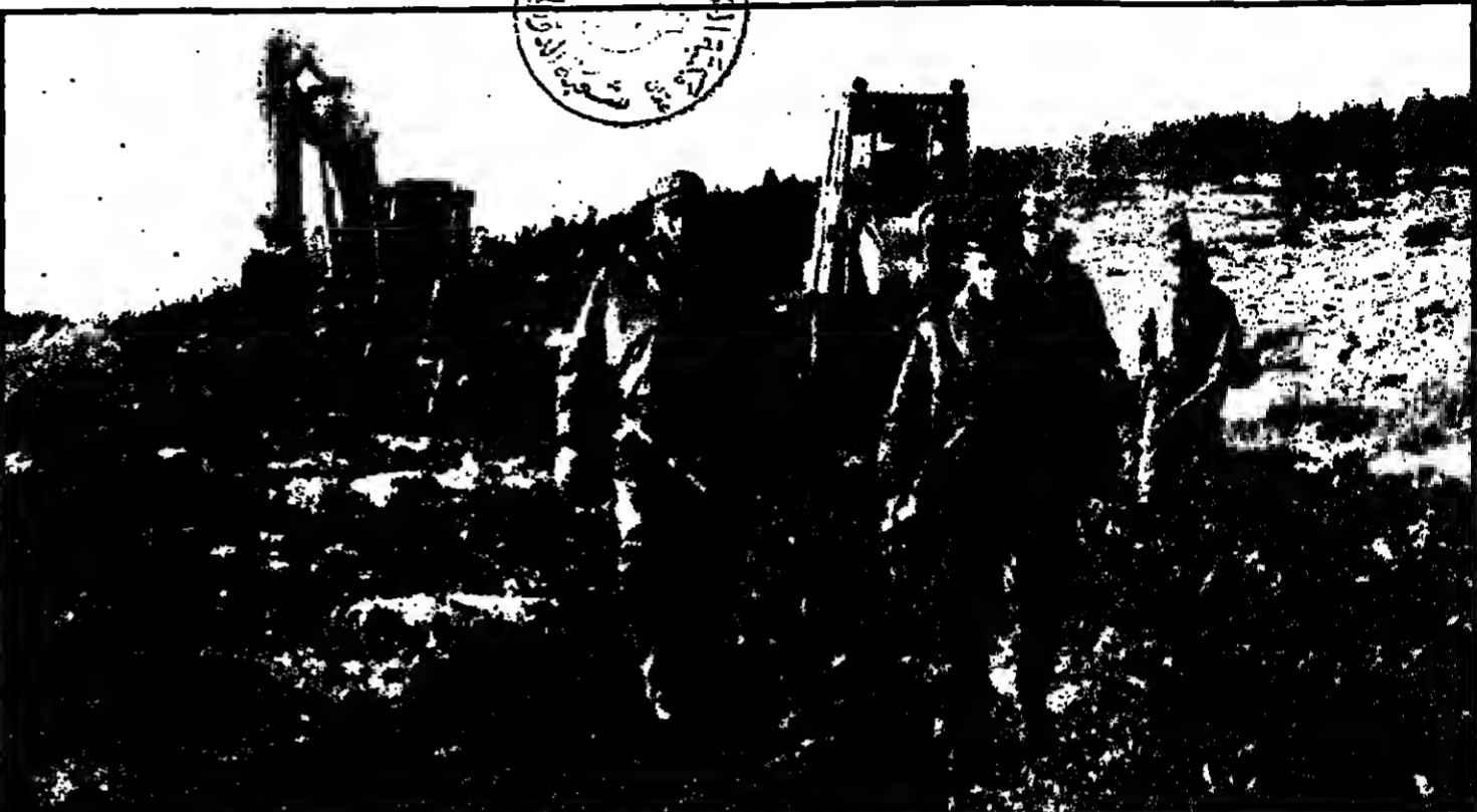
Border policemen protect construction equipment on Har Homa yesterday. (Brian Hender)

army helicopters circling overhead, was deployed throughout the area and on the roads leading to the site, as police and the IDF were on full alert for any distur-